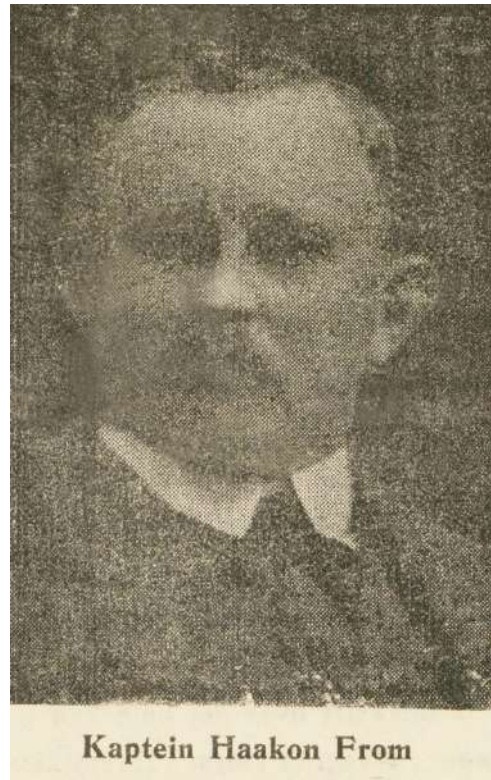
Fig. 8: partially retouched image

Now that the identities of the brothers had been established to my satisfaction, I was able to continue with my attempt to enhance the newspaper photo of the captain. The first step was to partially get rid of the distortion primarily around the captain's nose, eyes and mouth in the Photoshop document using the family photograph as a guide, a relatively simple process (Fig. 8).