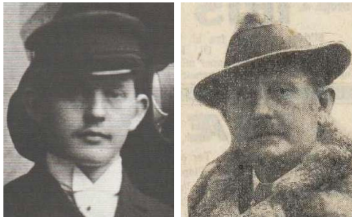
Figs. 6 & 7: Einar From

Subsequently, I discovered that Einar From (1872-1972) was a well-known landscape painter. Therefore, in order to move forward, further corroboration of young Einar's identity in the photograph (fig. 6) was required. I asked Kjetil to locate photographs of the artist, if possible. He accomplished this task within a relatively short time and forwarded a fairly decent newspaper photograph of Einar (fig. 7) to me. The resemblance looked unmistakable and thus, confirmed the identity of Einar in the family photograph. Haakon's identity was established by default. It is Einar who is seen on the left of the image wearing the captain's hat and Haakon on the right sporting the derby (see Fig. 2).