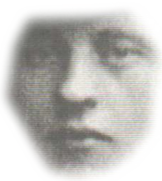
Fig. 10: feathered overlay