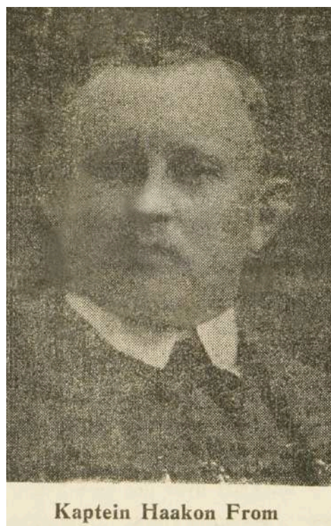
Fig. 12a: 21% overlay

The interim result (fig. 12a), a screenshot with opacity at 21%, is almost there. Even with the difference in modes (RGB and Greyscale), the two images blended together quite well. My goal of approximating the actual look of Captain Haakon From had been achieved. The final result, a screenshot on the next page (Fig. 12 b), has the opacity at just 15%. It is certainly not ideal but I think the composite image gives a better approximation of the captain's true appearance.