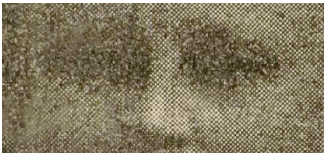
Fig. 3: eyes and nose