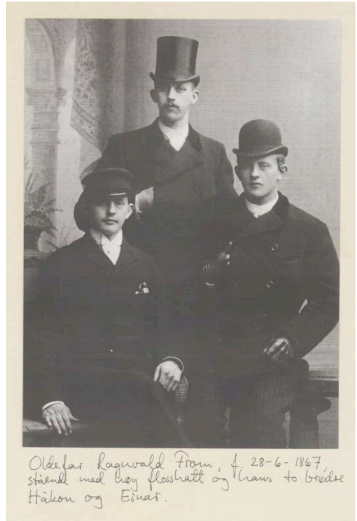
Fig. 2: From Brothers, ca.1890

Although the newspaper file itself was a high resolution TIFF, the photograph had several severe quality issues, notably, the heavy distortion on the right side of the subject's nose and an overt lack of visibility around the eyes and mouth (Figs. 3 & 4). These distortions caused a distinct imbalance within the overall newspaper photograph. Barring some unknown accident that may have affected his features, I suspected this image, for the most part, to not be an accurate representation of the captain. This notion presented itself even before I became aware of the family photograph.