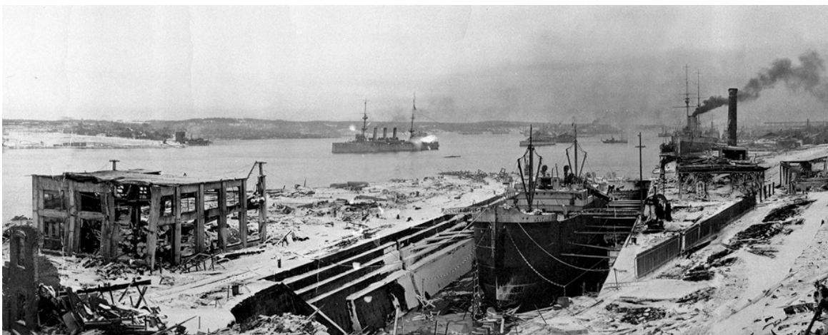
Halifax on Dec. 6, 1917 after a massive explosion in the harbour.