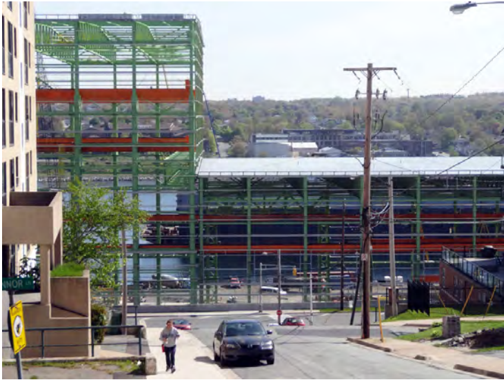
Irving Shipbuilding's massive fabrication shed, where Canada's new fleet of frigates and Arctic patrol vessels will be built, blocks the view of Halifax Harbour from a monument to victims of the 1917 explosion that killed almost 2,000. Dean Jobb

Irving plans to restore and display some of the artifacts at its new facilities. The company, Ms. Page added, is willing to work with the city to update the plaque at Needham Park — the one that touts the